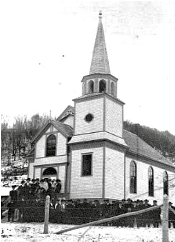
DEDICATION OF NEW CHURCH DECEMBER, 1906

Newsletter of the Bethlehem — Eidsvold Parish