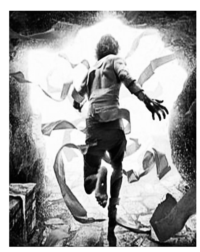
THE GREAT JOURNEY THROUGH HELL AND BACK: From Good Friday to Easter Sunday

Welcome to the beating Heart of the Church, The Pinnacle, the Once for All Victory over Death!